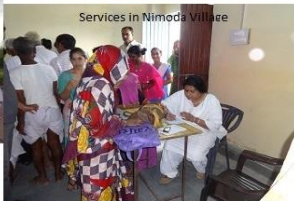
Services in Nimoda Village