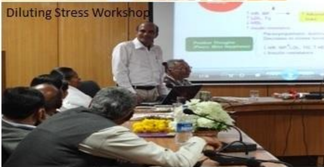
Diluting Stress Workshop